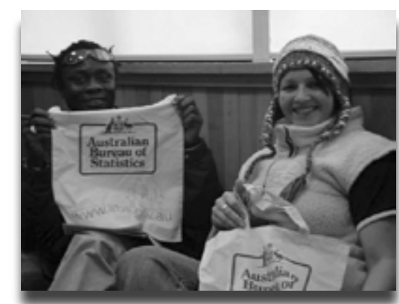
Students were given an ABS bag after their workshop